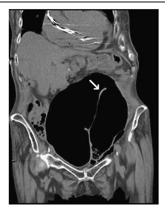
Fig. 2 CT abdomen, revealing a twisted loop of sigmoid forming two large air-filled compartments with a central double wall ending at the point of the twist (white arrow)